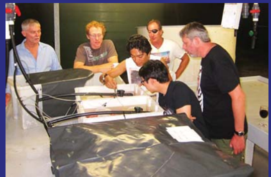
A coral disease experiment with Earthwatch volunteers at Orpheus Island Research Station.

In his new program at AIMS, Yui leads a research team of volunteers from the general public, to conduct biannual field trips to Orpheus Island Research Station. These 'citizen scientists' are recruited through the Earthwatch program "Recovery of the Great Barrier Reef". The program's key focuses are to (1) document the recovery of coral communities at the study site around Orpheus and Pelorus Island, which were devastated by severe tropical cyclone Yasi in 2011; and (2) understand the etiology of black band disease through microbial and molecular approaches, including its potential roles during the recovery phase of coral populations. These field trips have provided excellent opportunities to reach out to a wider audience and communicate Science and the effort