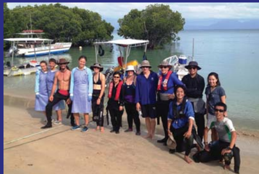
AIMS field trip with Earthwatch volunteers.