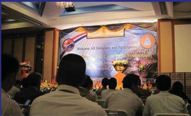
At the APCRS Symposium

The second Asia Pacific Coral Reef Symposium (APCRS) was held on Phuket Island, Thailand, between 20th and 24th June, 2010, hosted by Ramkhamhaeng University. Researchers, students and organization delegates from the Asia Pacific regions gathered together to discuss and identify the current status and the future of coral reefs of the regions.