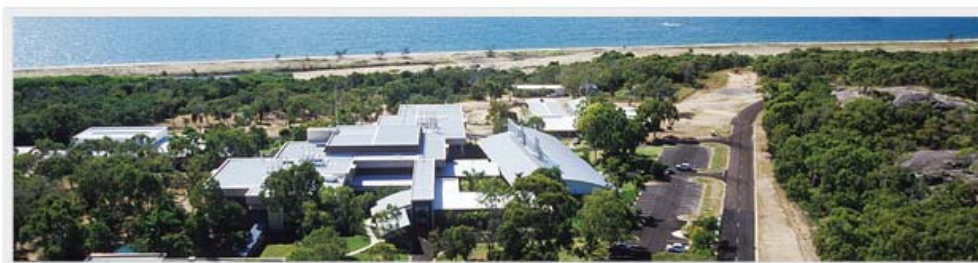
AIMS: Australia's tropical marine research agency.

Please note that as part of the AIMS@JCU re-structuring, the student support travel awards have been discontinued; therefore, the prize money associated with seminar day will be the only travel awards available to AIMS@JCU students. With impressive prizes available, two $2,500 awards towards conference travel, we look forward to some very competitive presentations.